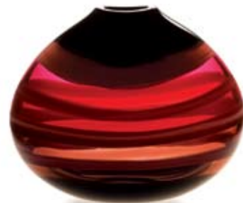
01-22-54M 9" T x 10.5" W ----- 01-22-54L 11" T x 12" W scarlet low oval vase