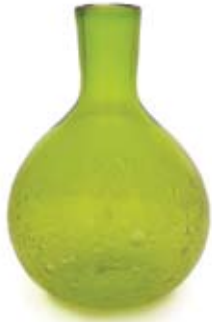
29-45-158S 8.5" T x 6" W olive jug mini bubble vase