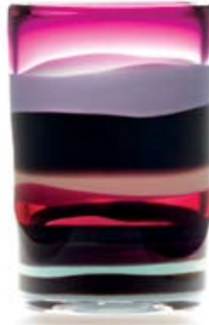
01-57-52M 8.5" T x 6.5" W 01-57-52L 11" T x 8" W amethyst square vase