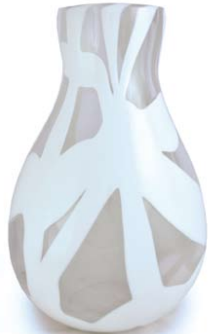
05-40-147 10" T x 6" W white chaos wrap netted bulb vase

*Each piece is handmade: dimensions may vary slightly.*