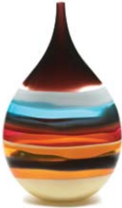
01-12-41M 15" T x 7" W 01-12-41L 16" T x 9" W cranberry teardrop vase