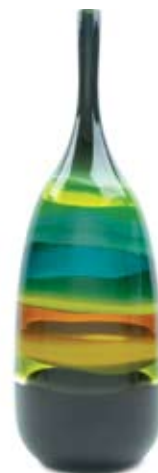
01-27-121 M 18" T x 6" W 01-27-121 L 20" T x 6.5" W moss tall bottle

*Each piece is handmade: dimensions may vary slightly.*