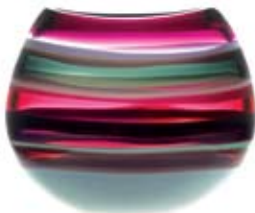
01-04-52 M 7" T x 10" W 01-04-52L 9" T x 12" W amethyst low uvase

These striking pieces draw inspiration from the rich hues and undulating topography of Southern California. Alternating layers of opaque and transparent colors are applied to clear glass. Overlaps create opportunities for new colors to be formed, which adds to the depth of the pieces. The intense color is then complimented by the simple, yet sophisticated, shapes. Hand blown and shaped in lead free crystal. Designed by Caleb Siemon. Made in California. Signed.