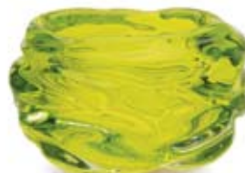
18-10-89L 5.5" T x 8" W lime green happy bowl