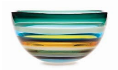
01-08-51M 6" T x 11" W 01-08-51L 6" T x 15" W aqua low bowl