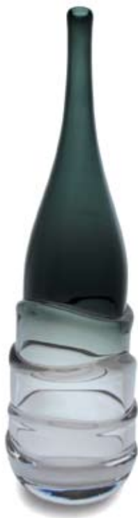
32-27-133 16"T x 4.5"W 32-27-133XL 19"T x 4.5"W grey pila bottle