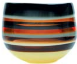
01-04-53M 7" T x 10" W 01-04-53L 9" T x 12" W amber low uvase

These striking pieces draw inspiration from the rich hues and undulating topography of Southern California. Alternating layers of opaque and transparent colors are applied to clear glass. Overlaps create opportunities for new colors to be formed, which adds to the depth of the pieces. The intense color is then complimented by the simple, yet sophisticated, shapes. Hand blown and shaped in lead free crystal. Designed by Caleb Siemon. Made in California. Signed.