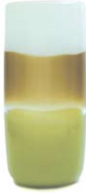
06-11-124 13.5" T x 6.5" W pistachio/sargasso flat cylinder vase