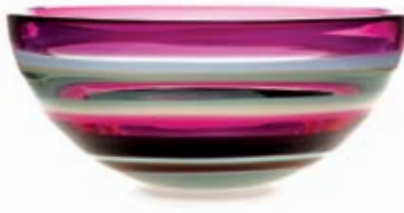
01-08-52M 6" T x 11" W 01-08-52L 6" T x 15" W amethyst low bowl