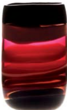
01-57-54M 8.5" T x 6.5" W ----- 01-57-54L 11" T x 8" W scarlet square vase