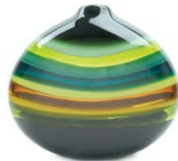
01-22-121M 9" T x 10.5" W 01-22-121L 11" T x 12" W moss low oval vase