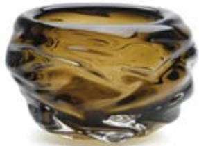
18-10-90L 5.5" T x 8" W sargasso happy bowl