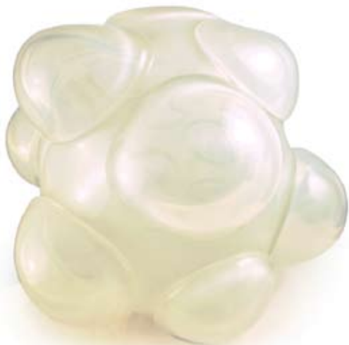
33-68-135 9"T x 10"W alabaster cumulo vase