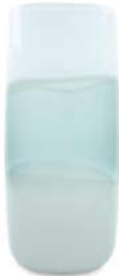
06-11-125 13.5" T x 6.5" W neutral/steel grey flat cylinder vase