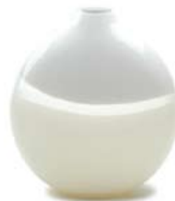
07-05-19S 8" T x 7" W ----- 07-05-19L 10" T x 9" W ----- 07-05-19XL 12" T x 11" W white/ivory round vase

*Each piece is handmade: dimensions may vary slightly.*