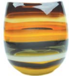
01-13-120M 10" T x 7" W 01-13-120L 12" T x 9" W mustard u vase