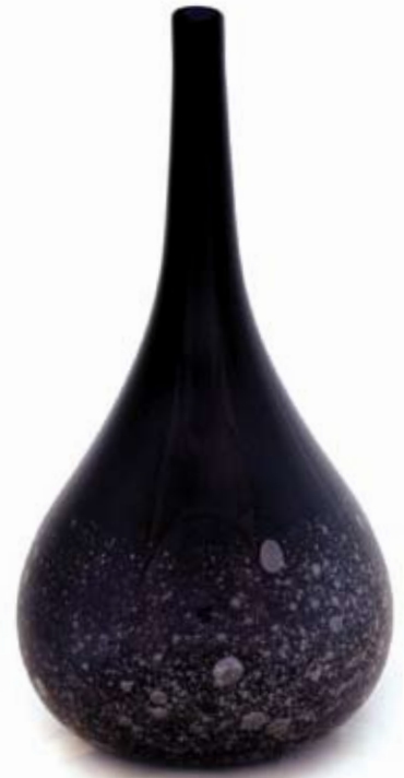
29-12-155S 12" T x 5" W midnight blue tall teardrop mini bubble vase

*Each piece is handmade: dimensions may vary slightly.*