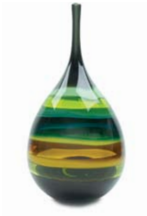
01-12-121M 15" T x 7" W 01-12-121L 16" T x 9" W moss teardrop vase