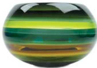
01-10-121M 6.5" T x 11" W 01-10-121L 6.5" T x 13" W moss closed bowl