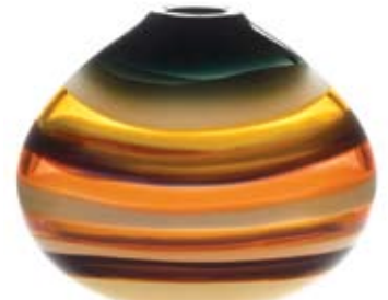
01-22-53M 9" T x 10.5" W ----- 01-22-53L 11" T x 12" W amber low oval vase