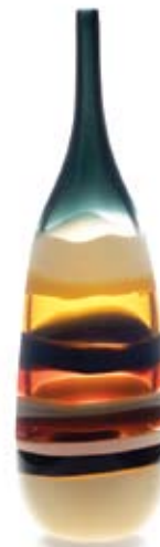
01-27-53M 18" T x 6" W 01-27-53L 20" T x 6.5" W amber tall bottle

*Each piece is handmade: dimensions may vary slightly.*