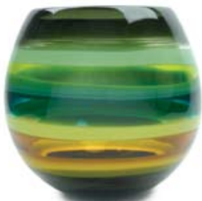
01-34-121M 8" T x 9" W 01-34-121L 9.5" T x 10" W moss barrel vase