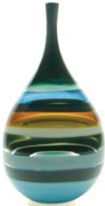
01-12-51M 15" T x 7" W 01-12-51L 16" T x 9" W aqua teardrop vase