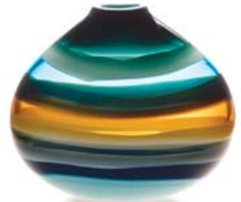
01-22-51M 9" T x 10.5" W 01-22-51L 11" T x 12" W aqua low oval vase