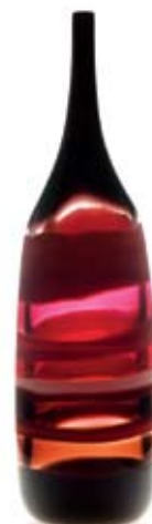
01-27-54M 18" T x 6" W 01-27-54L 20" T x 6.5" W scarlet tall bottle

*Each piece is handmade: dimensions may vary slightly.*