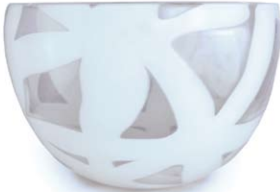
05-07-147 6.5" T x 9" W white chaos wrap netted tall bowl