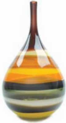
01-12-120M 15" T x 7" W 01-12-120L 16" T x 9" W mustard teardrop vase