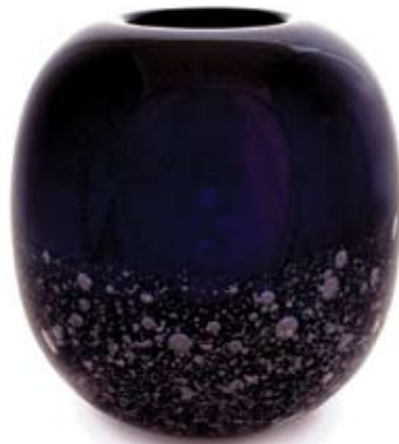
29-42-155S 7" T x 6" W midnight blue pill mini bubble vase