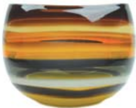
01-04-120M 7" T x 10" W 01-04-120L 9" T x 12" W mustard low vase