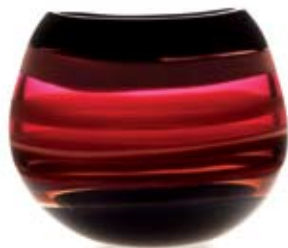
01-04-54M 7" T x 10" W 01-04-54L 9" T x 12" W scarlet low uvase

These striking pieces draw inspiration from the rich hues and undulating topography of Southern California. Alternating layers of opaque and transparent colors are applied to clear glass. Overlaps create opportunities for new colors to be formed, which adds to the depth of the pieces. The intense color is then complimented by the simple, yet sophisticated, shapes. Hand blown and shaped in lead free crystal. Designed by Caleb Siemon. Made in California. Signed.