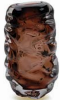
18-25-91L 9.5" T x 5" W aubergine happy cylinder vase