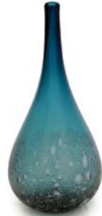
29-12-134S 12" T x 5" W steel blue tall teardrop mini bubble vase