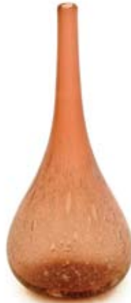
29-12-91S 12" T x 5" W aubergine tall teardrop mini bubble vase