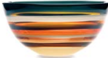
01-08-53M 6" T x 11" W 01-08-53L 6" T x 15" W amber low bowl