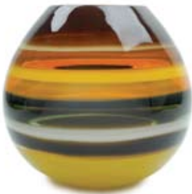
01-34-120M 8" T x 9" W 01-34-120L 9.5" T x 10" W mustard barrel vase