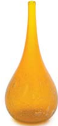
29-12-92S 12" T x 5" W gold topaz tall teardrop mini bubble vase