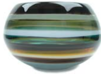
01-10-122M 6.5" T x 11" W ----- 01-10-122L 6.5" T x 13" W stone closed bowl