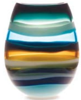
01-13-51M 10" T x 7" W 01-13-51L 12" T x 9" W aqua u vase