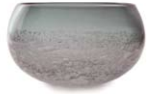
29-10-133 5.5" T x 9" W grey bubble closed bowl