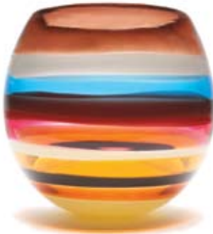
01-34-41M 8" T x 9" W 01-34-41L 9.5" T x 10" W cranberry barrel vase