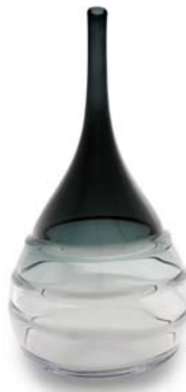
32-12-133 12"T x 6"W grey pila teardrop