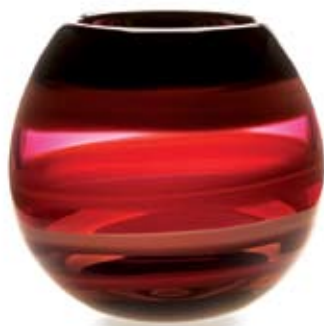
01-34-54M 8" T x 9" W ----- 01-34-54L 9.5" T x 10" W scarlet barrel vase