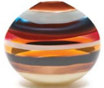
01-05-41M 9" T x 10.5" W 01-05-41L 11" T x 12" W cranberry flat round vase