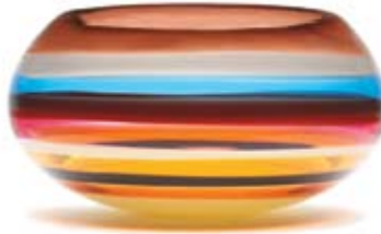
01-10-41M 6.5" T x 11" W 01-10-41L 6.5" T x 13" W cranberry closed bowl