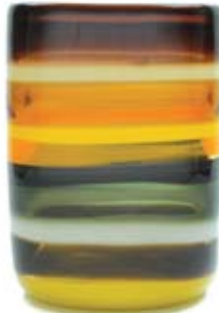
01-57-120M 8.5" T x 6.5" W 01-57-120L 11" T x 8" W mustard square vase