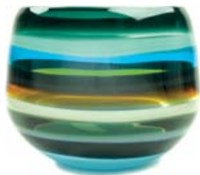
01-04-51 M 7" T x 10" W 01-04-51L 9" T x 12" W aqua low vase

These striking pieces draw inspiration from the rich hues and undulating topography of Southern California. Alternating layers of opaque and transparent colors are applied to clear glass. Overlaps create opportunities for new colors to be formed, which adds to the depth of the pieces. The intense color is then complimented by the simple, yet sophisticated, shapes. Hand blown and shaped in lead free crystal. Designed by Caleb Siemon. Made in California. Signed.