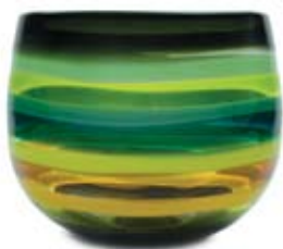
01-04-121 M 7" T x 10" W 01-04-121 L 9" T x 12" W moss low uvase