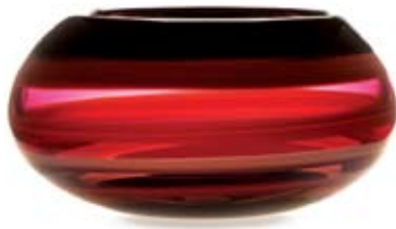
01-10-54M 6.5" T x 11" W ----- 01-10-54L 6.5" T x 13" W scarlet closed bowl