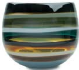
01-04-122M 7" T x 10" W 01-04-122L 9" T x 12" W stone low uvase