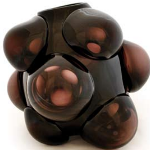
33-68-149 9"T x 10"W black cumulo vase

*Each piece is handmade: dimensions may vary slightly.*