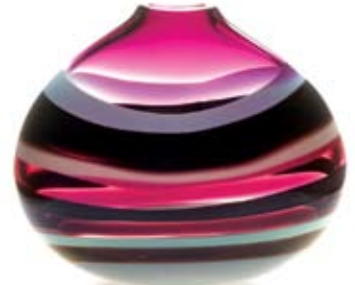
01-22-52M 9" T x 10.5" W 01-22-52L 11" T x 12" W amethyst low oval vase