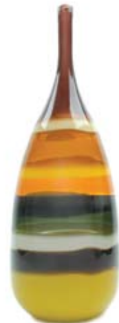
01-27-120M 18" T x 6" W 01-27-120L 20" T x 6.5" W mustard tall bottle

*Each piece is handmade: dimensions may vary slightly.*