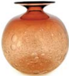
29-46-91S 6.5" T x 6.5" W aubergine flared bulb mini bubble vase