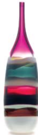
01-27-52M 18" T x 6" W 01-27-52L 20" T x 6.5" W amethyst tall bottle

*Each piece is handmade: dimensions may vary slightly.*