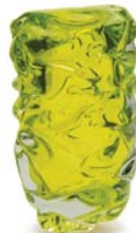
18-25-89L 9.5" T x 5" W lime green happy cylinder vase

*Each piece is handmade: dimensions may vary slightly.*