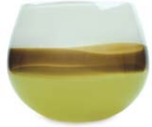
06-04-124 8.5" T x 10" W pistachio/sargasso low uvase