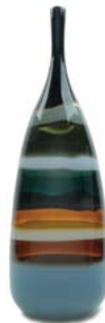
01-27-122M 18" T x 6" W 01-27-122L 20" T x 6.5" W stone tall bottle

*Each piece is handmade: dimensions may vary slightly.*