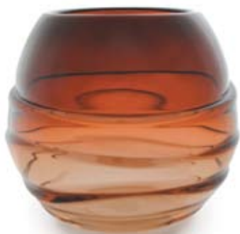
32-08-91 7.5" T x 7" W aubergine pila bowl