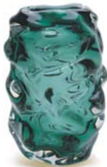
18-25-88L 9.5" T x 5" W steel grey happy cylinder vase