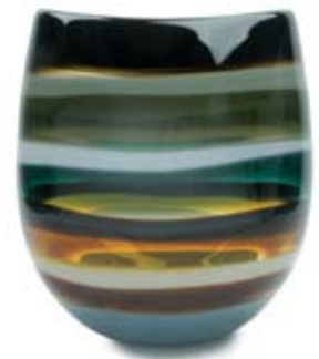
01-13-122M 10" T x 7" W ----- 01-13-122L 12" T x 9" W stone u vase