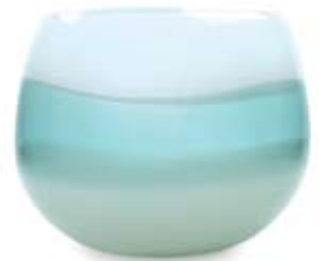
06-04-125 8.5" T x 10" W neutral/steel grey low uvase