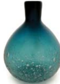
29-45-134S 8.5" T x 6" W steel blue jug mini bubble vase