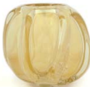
05-34-145 6" T x 5.5" W gold vertical wrap barrel vase