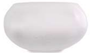
alabaster bubble barrel vase