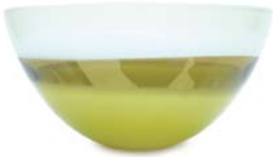
06-08-124 7.5" T x 11.5" W pistachio/sargasso low bowl