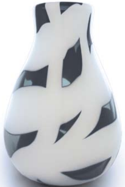
05-40-160 10" T x 6" W white and grey chaos wrap netted bulb vase