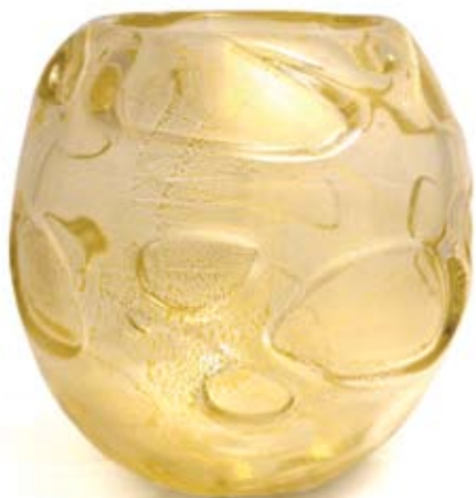
05-34-143 8" T x 5.5" W gold chaos wrap barrel vase