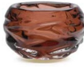
18-10-91L 5.5" T x 8" W aubergine happy bowl