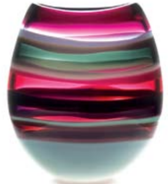
01-13-52M 10" T x 7" W 01-13-52L 12" T x 9" W amethyst u vase