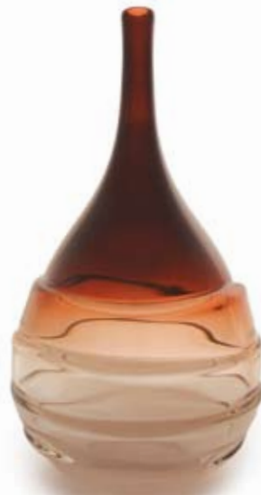
32-12-91 12" T x 6" W aubergine pila teardrop

*Each piece is handmade: dimensions may vary slightly.*