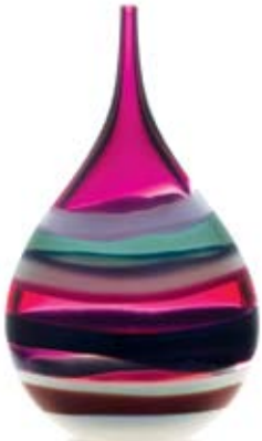
01-12-52M 15" T x 7" W 01-12-52L 16" T x 9" W amethyst teardrop vase