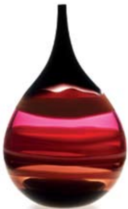
01-12-54M 15" T x 7" W ----- 01-12-54L 16" T x 9" W scarlet teardrop vase