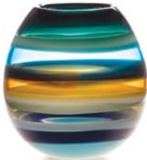
01-34-51M 8" T x 9" W 01-34-51L 9.5" T x 10" W aqua barrel vase