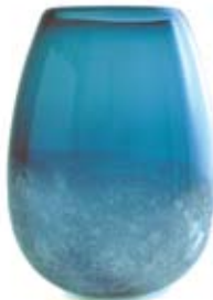
29-34-134 9" T x 6" W steel blue bubble barrel vase