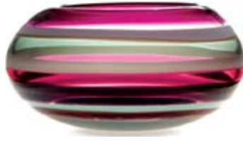
01-10-52M 6.5" T x 11" W 01-10-52L 6.5" T x 13" W amethyst closed bowl