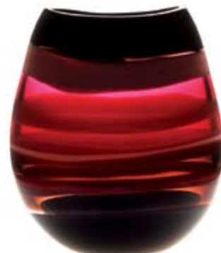
01-13-54M 10" T x 7" W ----- 01-13-54L 12" T x 9" W scarlet u vase