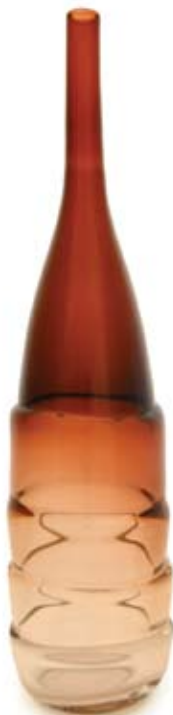
32-27-91 16" T x 4.5" W 32-27-91XL 19" T x 4.5" W aubergine pila bottle