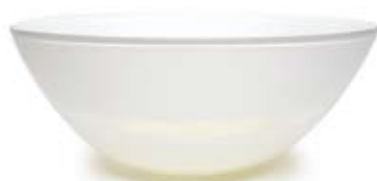
07-08-19S 5" T x 8" W ----- 07-08-19L 5" T x 12.5" W ----- 07-08-19XL 5.5" T x 15" W white/ivory bowl

This grouping is a variation of the banded line. The name refers to the Italian technique of lattimo or milk glass. These pieces focus on their forms rather than their color. Two opaque swathes of color are wrapped around a clear glass bubble. This line is currently made in a white and ivory combination in multiple sizes and an array of refined silhouettes. Hand blown and shaped in lead free crystal. Designed by Caleb Siemon. Made in California. Signed.