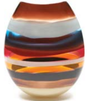
01-13-41M 10" T x 7" W 01-13-41L 12" T x 9" W cranberry u vase