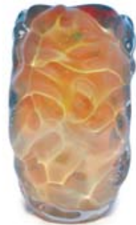
18-25-92L 9.5" T x 5" W gold topaz happy cylinder vase