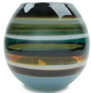
01-34-122M 8" T x 9" W ----- 01-34-122L 9.5" T x 10" W stone barrel vase