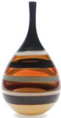
01-12-53M 15" T x 7" W ----- 01-12-53L 16" T x 9" W amber teardrop vase