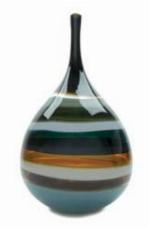
01-12-122M 15" T x 7" W ----- 01-12-122L 16" T x 9" W stone teardrop vase