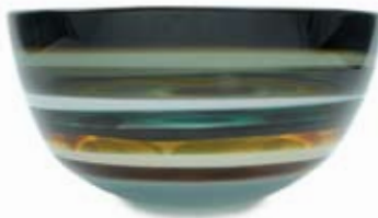
01-08-122M 6" T x 11" W 01-08-122L 6" T x 15" W stone low bowl