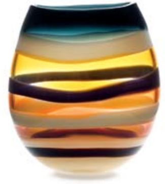
01-13-53M 10" T x 7" W ----- 01-13-53L 12" T x 9" W amber u vase