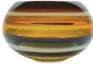
01-10-120M 6.5" T x 11" W 01-10-120L 6.5" T x 13" W mustard closed bowl