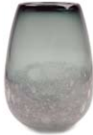
29-34-133 9" T x 6" W grey bubble barrel vase