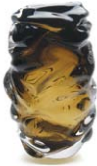
18-25-90L 9.5" T x 5" W sargasso happy cylinder vase