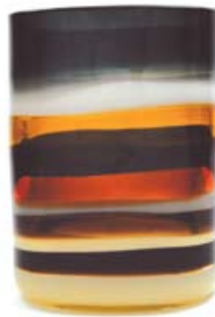
01-57-53M 8.5" T x 6.5" W ----- 01-57-53L 11" T x 8" W amber square vase