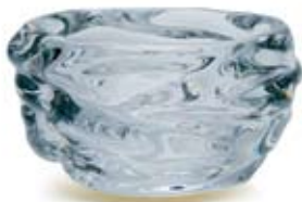
18-10-48L 5.5" T x 8" W clear happy bowl