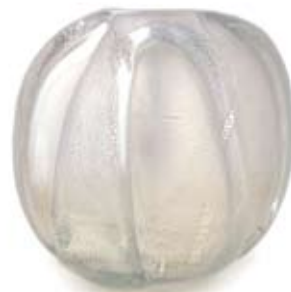
05-34-146 6" T x 5.5" W silver vertical wrap barrel vase