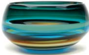
01-10-51M 6.5" T x 11" W 01-10-51L 6.5" T x 13" W aqua closed bowl