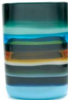
01-57-51M 8.5" T x 6.5" W 01-57-51L 11" T x 8" W aqua square vase