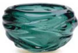
18-10-88L 5.5" T x 8" W steel grey happy bowl

These works are a departure from the careful shapes of the banded vessels. They are reminiscent of another era and play with the reflective and malleable qualities of glass. This line consists of heavy thick-walled vessels, which are hand manipulated to create a creased and singularly individual form for each piece. The vessels are either blown in solid clear glass or use the Italian technique of 'sommerso' or encased color. Signed.