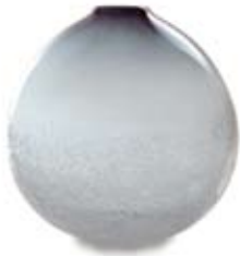
29-05-133 9" T x 9" W grey bubble round vase