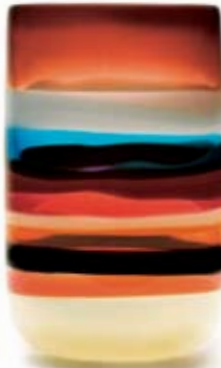
01-57-41M 8.5" T x 6.5" W 01-57-41L 11" T x 8" W cranberry square vase