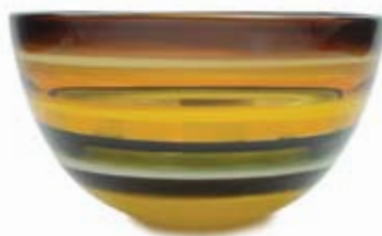
01-08-120M 6" T x 11" W 01-08-120L 6" T x 15" W mustard low bowl