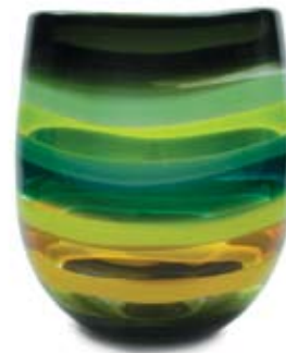
01-13-121M 10" T x 7" W 01-13-121L 12" T x 9" W moss u vase