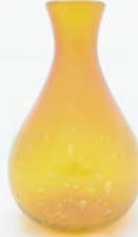
29-65-92S 9" T x 5" W gold topaz flared teardrop mini bubble vase