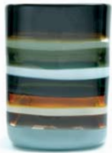
01-57-122M 8.5" T x 6.5" W ----- 01-57-122L 11" T x 8" W stone square vase