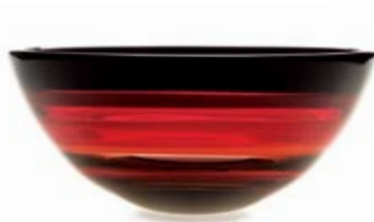
01-08-54M 6" T x 11" W 01-08-54L 6" T x 15" W scarlet low bowl