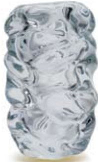
18-25-48L 9.5" T x 5" W clear happy cylinder vase