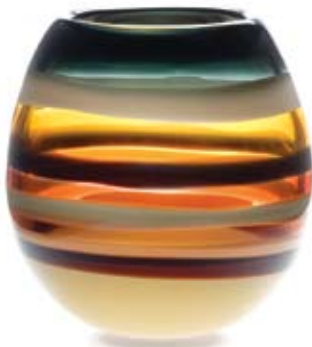
01-34-53M 8" T x 9" W ----- 01-34-53L 9.5" T x 10" W amber barrel vase