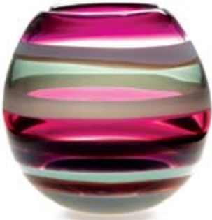
01-34-52M 8" T x 9" W 01-34-52L 9.5" T x 10" W amethyst barrel vase