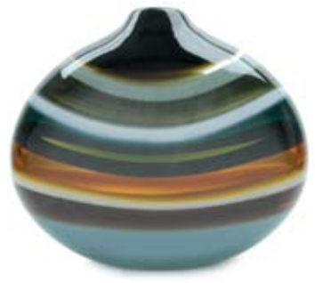
01-22-122M 9" T x 10.5" W ----- 01-22-122L 11" T x 12" W stone low oval vase