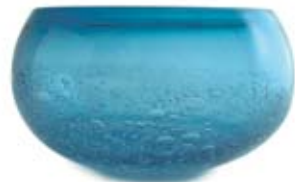
29-10-134 5.5" T x 9" W steel blue bubble closed bowl

*Each piece is handmade: dimensions may vary slightly.*