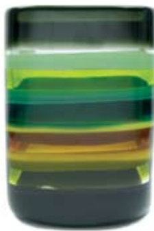
01-57-121M 8.5" T x 6.5" W 01-57-121L 11" T x 8" W moss square vase