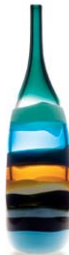
01-27-51M 18" T x 6" W 01-27-51L 20" T x 6.5" W aqua tall bottle

*Each piece is handmade: dimensions may vary slightly.*