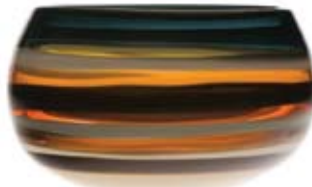
01-10-53M 6.5" T x 11" W ----- 01-10-53L 6.5" T x 13" W amber closed bowl