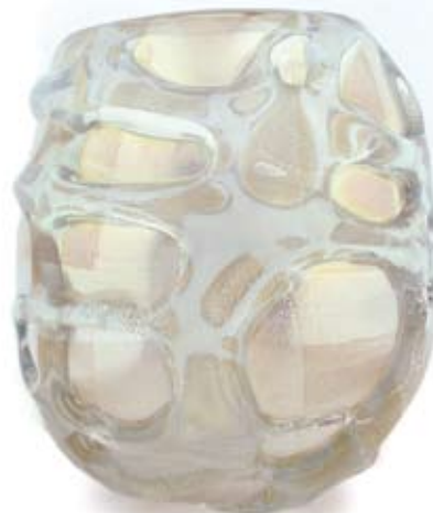
05-34-144 8" T x 5.5" W silver chaos wrap barrel vase