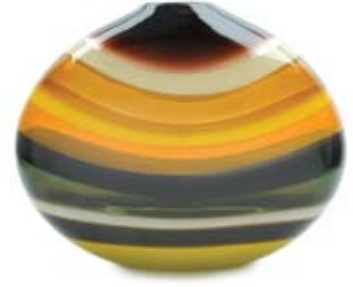
01-22-120M 9" T x 10.5" W 01-22-120L 11" T x 12" W mustard low oval vase