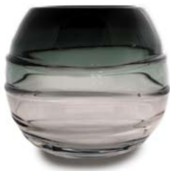
32-08-133 7.5"T x 7"W grey pila bowl