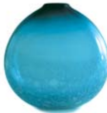
29-05-134 9" T x 9" W steel blue bubble round vase