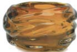
18-10-92L 5.5" T x 8" W gold topaz happy bowl