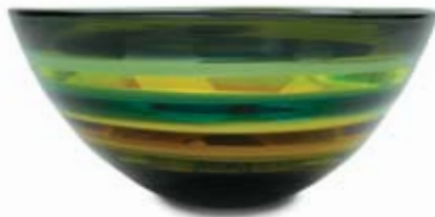
01-08-121 M 6" T x 11" W 01-08-121 L 6" T x 15" W moss low bowl