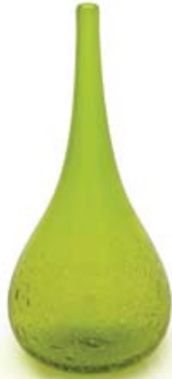
29-45-158S 12" T x 5" W olive tall teardrop mini bubble vase